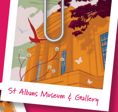
St Albans Museum & Gallery