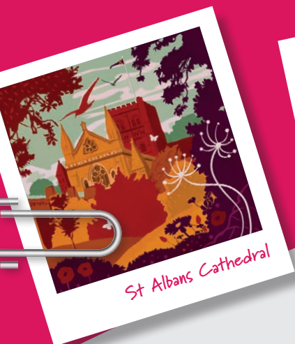
St Albans Cathedral

Information on other Abbey Flyer walks and cycling routes in Hertfordshire are available from www.hertfordshire.gov.uk