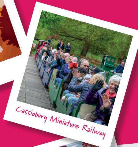
Cassiobury Miniature Railway