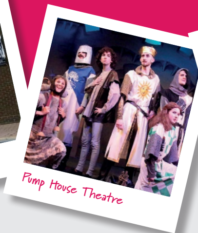
Pump House Theatre